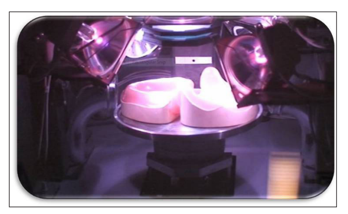
Figure 3: Curing of the baseplate/cast in an Eclipse light-curing unit.