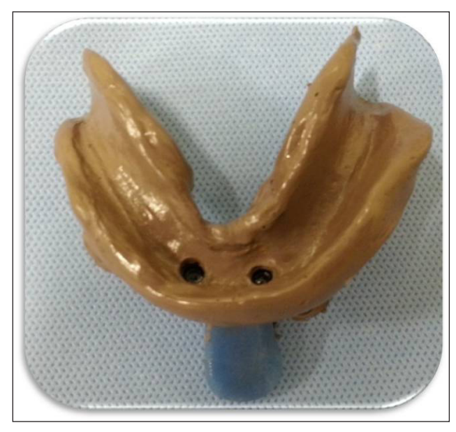
Figure 1: Abutment level final impression.