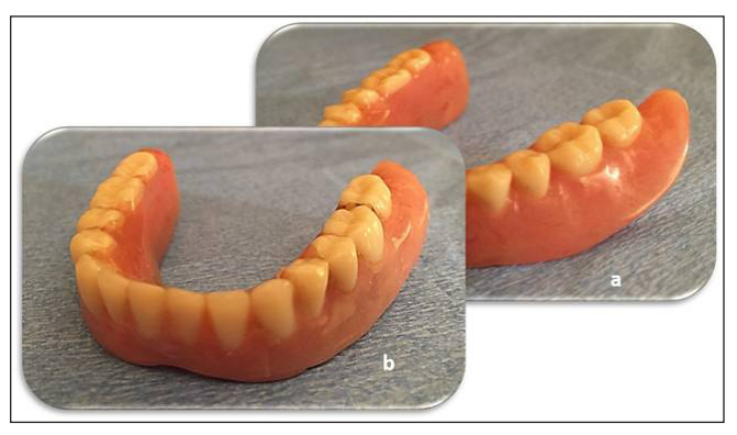
Figure 4: Heat-cured acrylic resin denture (a) and Eclipse denture (b) after 6 months.

(P = 0.002). Because of their aesthetics, the overdentures constructed from Lucitone-199 was preferred by the patients overall [Figure 4].