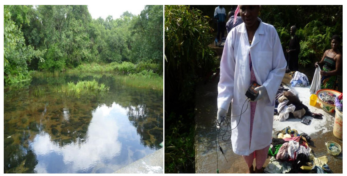
Plate 1: Manchok water intake