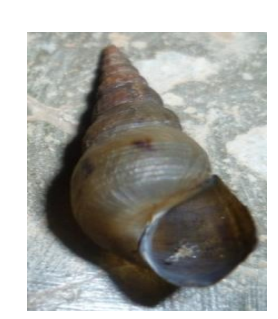
Fig.2 b: Apertural view of Melanoides tuberculata