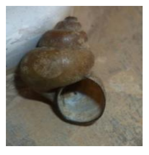
Fig,3 b: Apertural view of Bellamya unicolor