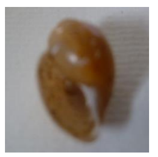
Fig 6b : Apertural view of Physa spp