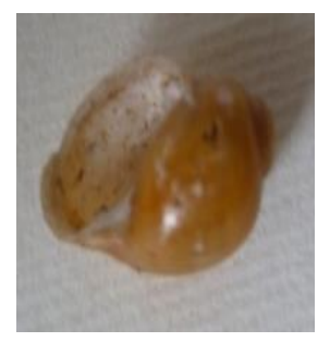
Fig.6a: Lateral view of Physa spp