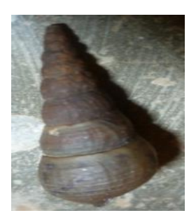
Fig.2 a: Abarpertural view of Melanoides tuberculata