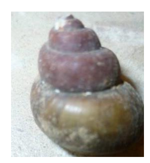
Fig.3 a: Abarpertural view of Bellamya unicolor