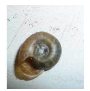
Fig.4 b: Apertural view of Biomphalaria pfeifferi