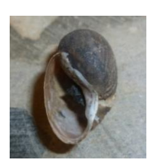
Fig.7 b: Apertural view of Bulinus globosus