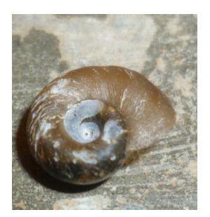
Fig.4a: Dorsal view of Biomphalaria pfeifferi