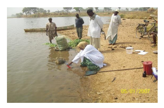
Figure 1 : Researcher measuring water pH with some farmers washing their vegetables in the water at Gimbawa dam

to increase food production. Bulk of tomatoes, onions and sugar cane grown in the state are from this area. Occupational activities centered mainly on fishing, irrigation and livestock watering. Vegetation along the bank is mainly grasses with short trees.