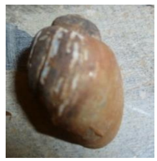
Fig.7 a: Abarpertural view of Bulinus globosus