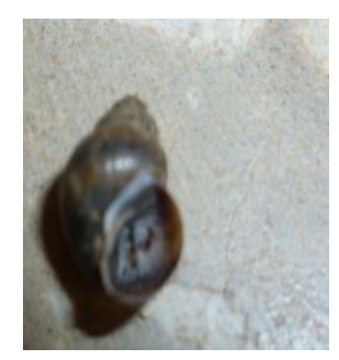
Fig.8b: Apertural view Cleopatra bulimoides