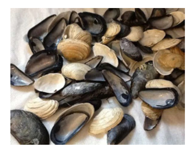
Figure 2: Clam Shells

It denotes actions performed for safer and cleaner immediate surroundings, without violating the recommended international safety standards and criteria<sup>12</sup>. There are different types of remediation ranging from