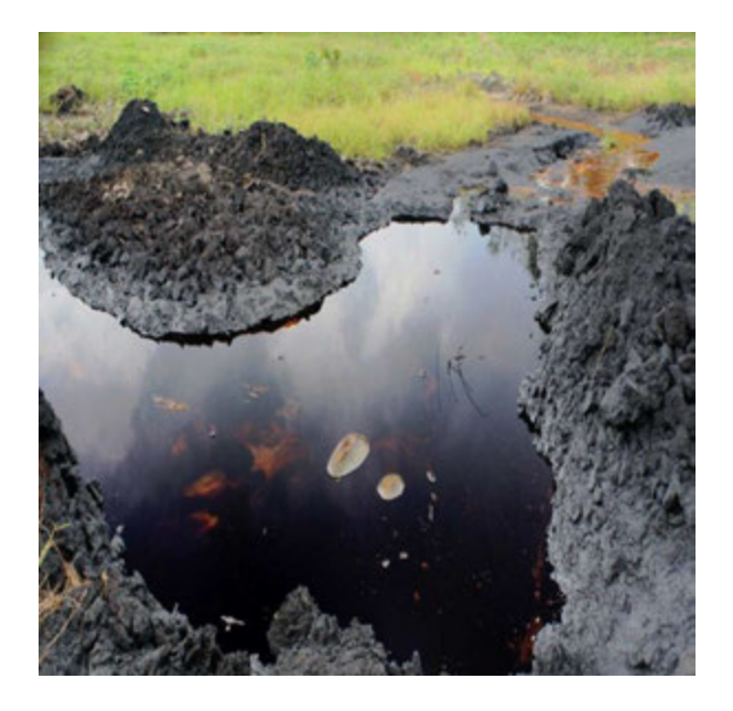
Figure 3: Crude oil contaminated sites (River and farm land) in Niger delta region, Nigeria.

remediation denotes contaminants and pollutants removal from human environment (consisting the soil, water bodies, ground water, atmosphere and surface water). biological, physical, chemical remediation depending on the nature of the adsorbents. Figure 3 shows a typical contaminated site in the Niger Delta region of Nigeria.