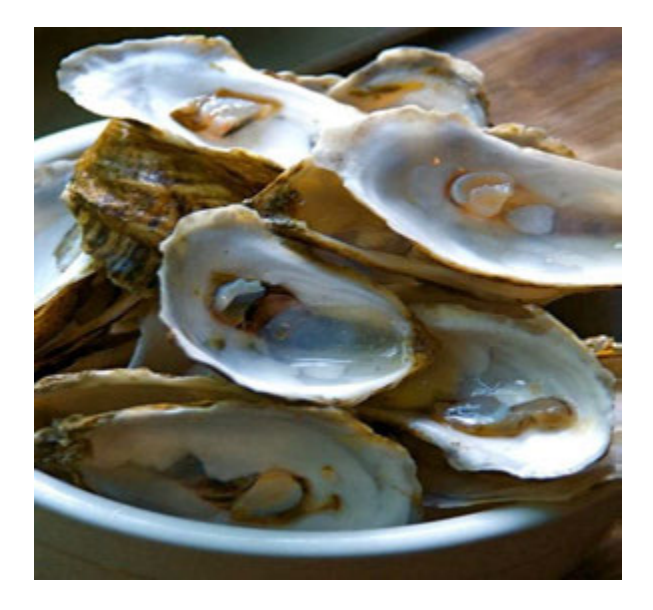
Figure 1: Oyster Shells

Environmental remediation refers to clean-up, abatement and subsiding to minimize, curtail and remove harmful and toxic compounds from human environment. Environmental