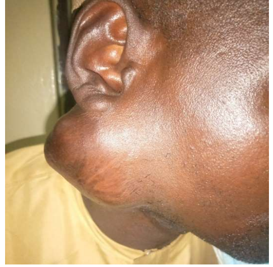
Figure 1: Pleomorphic adenoma of right parotid gland