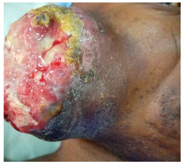
Figure 2a: Mucoepidermoid Carcinoma of right parotid gland.