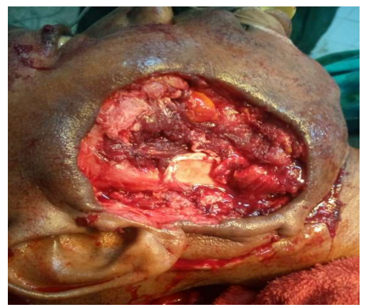
Figure 2b: Intraoperative surgical site after tumor excision