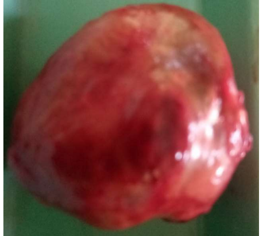
Figure 3d: The excised tumor

Most of the reviews of salivary gland tumor series showed that more females were affected more than males in both benign and malignant cases.<sup>8,14,17</sup> This varied with the type of tumor; for example, males predominate in Warthin's tumor.<sup>2</sup> Ito et al.<sup>12</sup> found that there were more female patients in benign tumors (58.5%), whereas males predominated in malignant tumors (52.2%).<sup>6</sup> There was a slight male preponderance in this study, which differs from previous studies