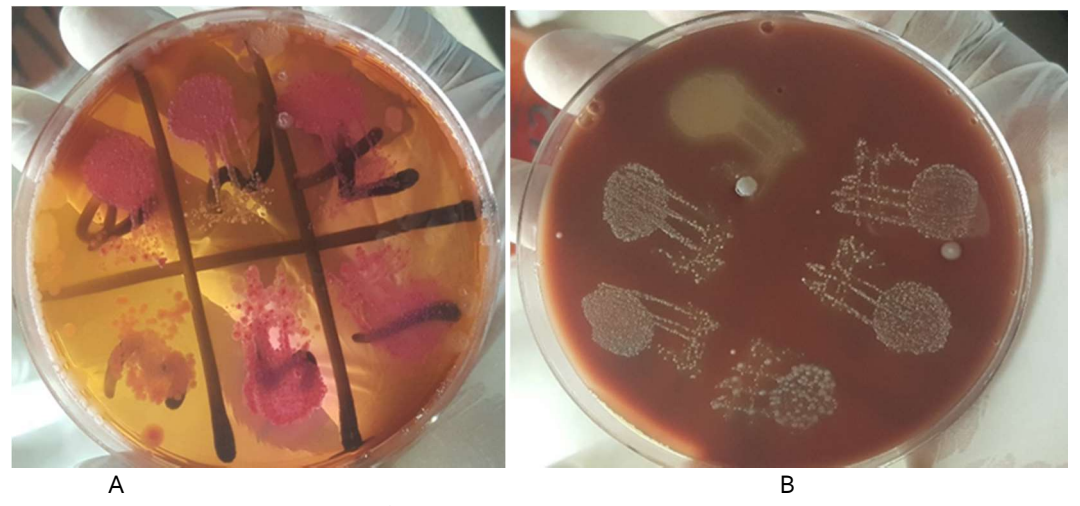
Figure 1 showing isolate culture from participants on a MacConkey agar (labelled A) and on a chocolate agar (labelled B)

The result of the neat dilution, serial dilution and the average diameter of zone of inhibition as measured in millimeters (mm) is shown in table 3. From the table, the average zone of inhibition of the selected non-fluoride toothpaste on Staphylococcus spp , Klebsiella spp , Lactobacilli spp and Streptococcus spp were 13.9mm, 14.4mm, 15.2mm and 2mm(R) respectively. which indicated that Streptococcus spp was resistant(R) while the maximum zone of inhibition was on Lactobacilli . It was also observed that zone of inhibition decreases with the increase in dilution except for Streptococcus spp .