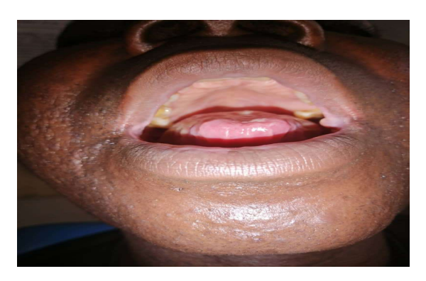
Figure 3 : intra-oral view showing healing oral lesions