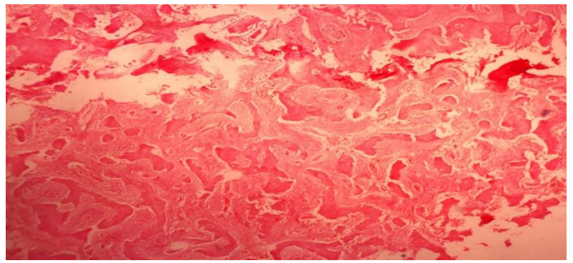
Figure 5 x100Mag: The histologic section shows irregular trabeculae of woven bone merging to form complex shapes reminiscent of Chinese letters without osteoblastic rimming and surrounded by fibrovascular stroma.