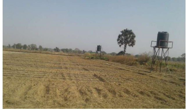
Figure 2: Layout of Experimental Plots

Two sets of plastic tanks each with a capacity of 3000 liters were mounted on a stanchion and utilized as the construction materials for the gravity drip irrigation configuration (Figure 2). Each stanchion rises 3.2 m above the surrounding terrain. 1.25" (one and a quarter inch) sub-mainline pipes, 0.25" (one-quarter inch) laterals, and mainline pipes with diameters of 2" (two inches) and 1.5" (one and a half inches) are attached. This drip kit was set up in the field, spanning a 2500 m2 area with lateral lengths of 25 m and sub-main lengths of 100 m. The water was transferred from the main canal to the plastic storage tanks using a two-inch centrifugal pump.