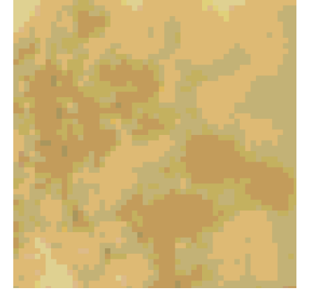
M.TB +fungal contamination