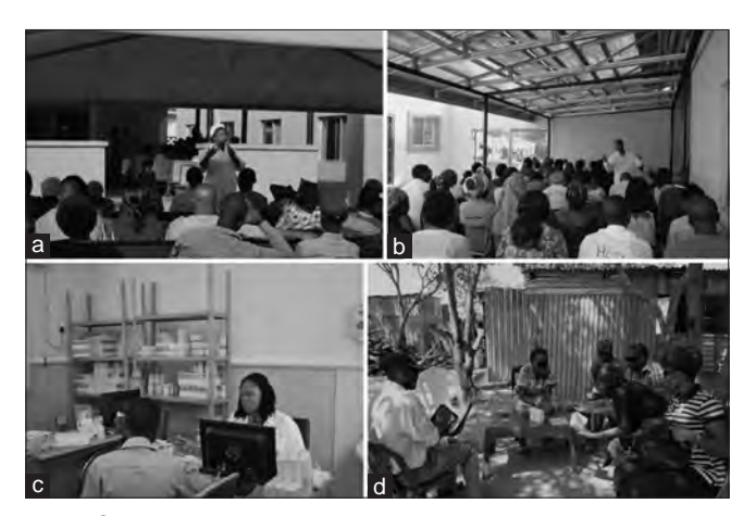
Figure 3: (a) Health talk. (b) Adherence counseling. (c) ART pharmacy. (d) Group leader disturbing drugs

Comparison of Means before and after CAG and significance. Hebefore CAG, Heafter CAG, **=Body mass index, L =lower, U=upper, PCV=packed cell volume, SBP=systolic blood pressure, DBP=Diastolic blood pressure, <sup>††</sup>=Viral load