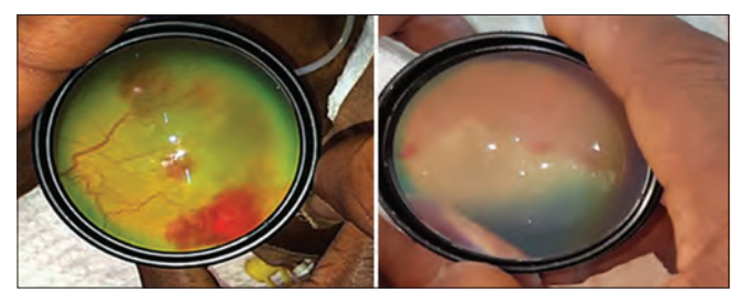
Figure 1: Retinopathy of prematurity in Ibadan

Despite the benefits of anti-VEGF, possible disadvantages include the possible development of endophthalmitis and