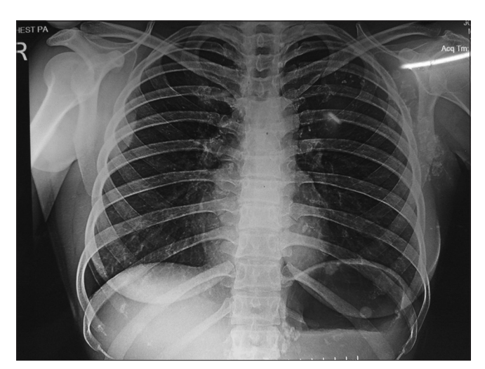
Figure 1: Chest X-ray showing multiple calcified lymph nodes in the left axilla

TB is one of the most common communicable diseases in developing countries. It can affect any organ in the body.