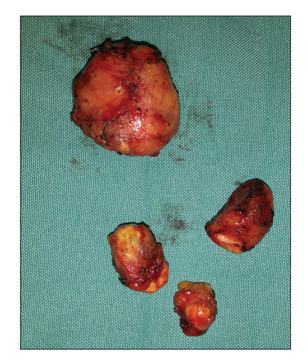
Figure 3: Postoperative picture of the excised axillary lymph nodes

In extrapulmonary TB, tuberculous lymphadenitis is more common.<sup>[1]</sup> Within tuberculous lymphadenitis, the cervical lymph node is more commonly affected than other regional lymph nodes.<sup>[2]</sup> The axillary lymph nodes are more affected by 3% of tuberculous lymphadenitis. Isolated axillary tuberculous lymphadenitis is rare without evidence of TB elsewhere in the body.<sup>[3]</sup>