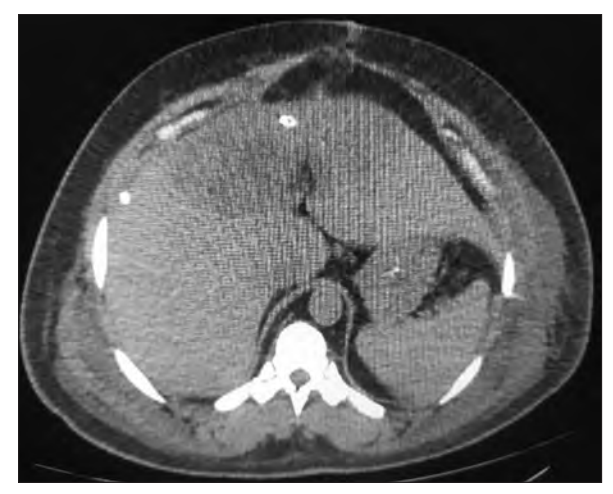
Figure 2: Right liver lobe abscess in the second patient with a piece of foreign body in the Segment IV

Liver abscess is considered rare in clinical practice; it is even rarer to have liver abscess secondary to swallowed foreign