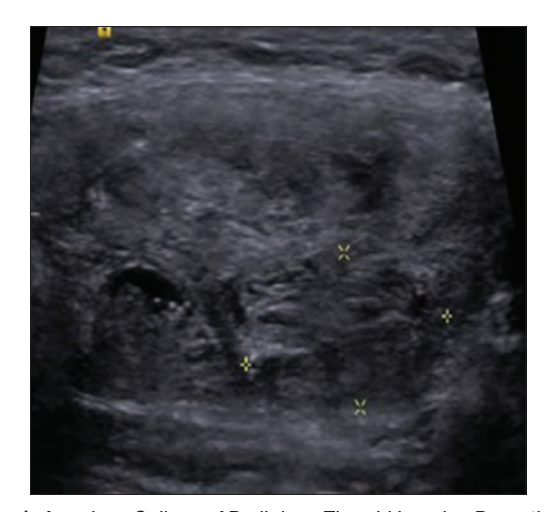
Figure 1: American College of Radiology Thyroid Imaging Reporting and Data System 2 thyroid nodule

Out of 69 study subjects, 46 cases had mixed composition, whereas 12 cases were solid, and 11 cases had cystic/ spongiform composition (P < 0.05). Based on echogenicity, 50 cases were hyperechoic, 12 were hypoechoic, 5 were anechoic,