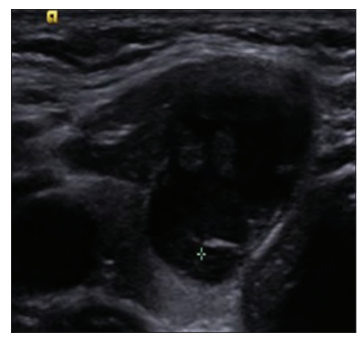
Figure 3: American College of Radiology Thyroid Imaging Reporting and Data System 4 thyroid nodule

In our study on nodules with unknown cytology, the accuracy of differentiating malignant from benign nodules with B-mode USG using ACR TI-RADS was much high than Stoian et al. <sup>[10]</sup>