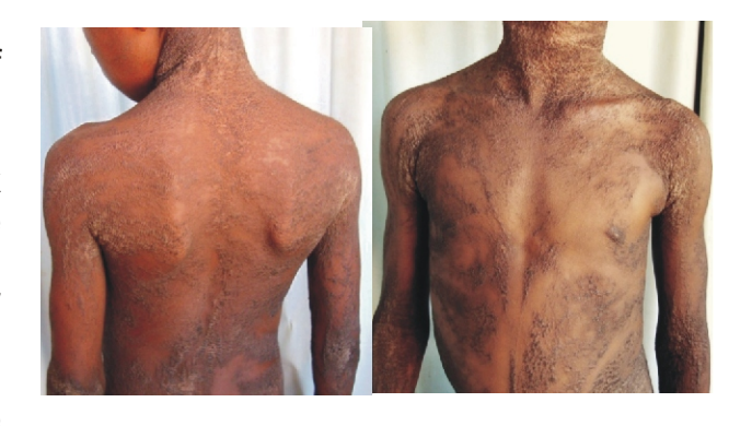
Figure 1 & 2: Extensive verrucous skin lesions along the lines of Blaschko

The patient was prescribed oral retinoids and topical salicylic acid, the former was not available in the country, while the latter was used for 6 months without appreciable response.