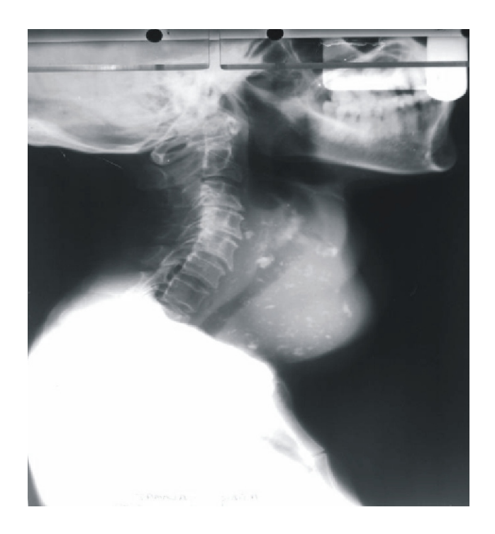
Fig. 3: Thyroid Calcification in one of the patients with Thyroid Malignancy