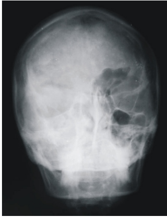
Fig 2: Thyroid Malignancy with Skull Metastasis. Note the involvement of the paranasal sinuses (frontal, sphenoidal maxillary and mastoid).