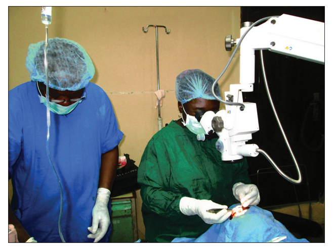
Figure 2: Theater session at State Specialist Hospital, Asubiaro using the TOPCON operating microscope

of patients in Osogbo satellite center seen are reported biannually. Community or school screening for children are also done. Workshop on eye care is supposed to help other health workers to identify and refer cases to Ophthalmologist