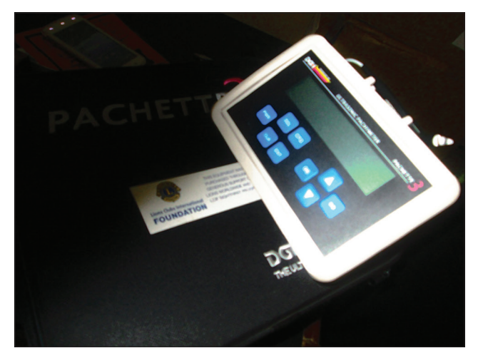
Figure 1: Ultrasonic pachymeter

Methods: The sociodemographics, clinical, and surgical records