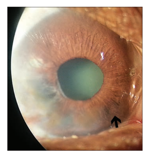
Figure 2: The arrow shows areas of iris fibrils floating in the aqueous humor at 5 o'clock

Shima et al. <sup>[10]</sup> reported a case of iridoschisis with plateau iris configuration and anteriorly positioned ciliary body with flat iris in both eyes. Iridoschisis has also been linked with lens subluxation.<sup>[11]</sup> It may occur with an anteriorly subluxated lens, pushing the iris forward leading to shallowing of the anterior chamber thereby causing angle closure glaucoma.