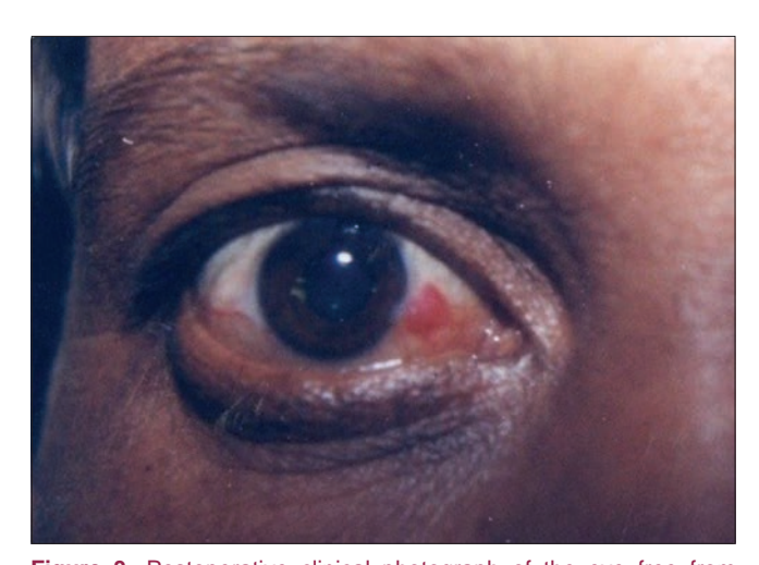
Figure 3: Postoperative clinical photograph of the eye free from squamous cell carcinoma

the cornea are sufficiently rare to warrant reporting in each instance.