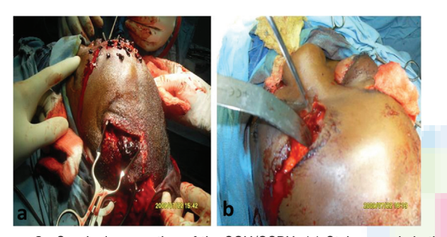
Figure 3: Surgical evacuation of the SGH/OSPH. (a) Stab wounds in the scalp to deliver the SGH, and sub-brow incisions to evacuate the OSPH. The two haematoma are seen to be clotted blood, would not be deliverable in the orbital subperiosteal space with mere needle aspiration. (b) The right sub-brow incision was extended downward for a frontoethmoidectomy to deliver the associated clots in the frontal sinus

SGH occurs when shearing forces applied to the scalp violate the blood vessels, mainly venous, criss-crossing this capacious subgaleal space. The causes of this type of bleed include trauma. This includes a few usually minor incidents such as falls from the bed, especially in infants, or occasionally more severe trauma as in road crashes, either motor-vehicular, motor-cycle or even bicycle.<sup>[7,11]</sup> Other causative incidents include hair combing/pulling and hair braiding. There are also spontaneous cases from coagulopathies such as in the von Williebrand's disease, the sickle cell disease and even connective tissue