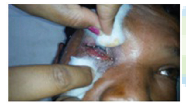
Figure 2: Absence of right eyeball from the orbit