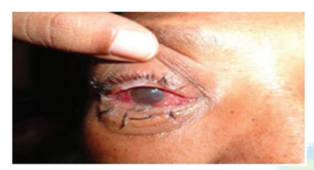
Figure 9: Postoperative