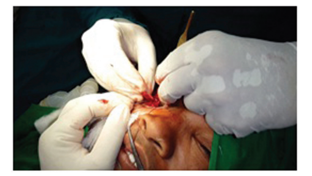
Figure 7: Orbital floor fracture was repaired by bone graft

Gross examination revealed an intact globe with corneal abrasion, dilated pupil, and normal anterior chamber depth. Optic nerve and extraocular muscles were found to be intact. Orbital floor fracture was repaired with bone graft