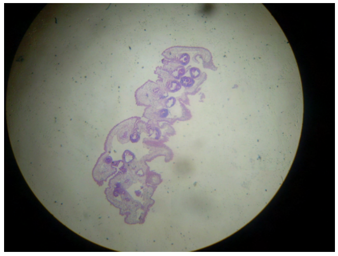
Figure 2. Microscopic section of the cestode worm after surgical removal from the anterior chamber of eye H&E X400.