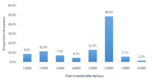
Fig 2: Proportion of participants who commenced complementary feeding in the first eight months of life.