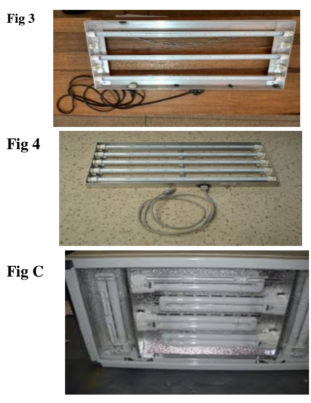
Fig 1; Locally fabricated (F) phototherapy devices F 1- 4 and a commercially-obtained (C) device. F1, 2, and C use fluorescent lamps, while F3 and 4 use led-tubes as light sources.