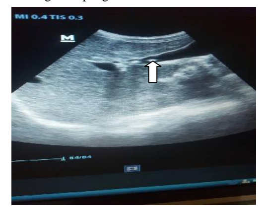
Fig 1: Abdominal ultrasound scan of a 14 year old sickler showing multiple gall bladder stones

Abdominal ultrasonography showed hepatomegaly with liver span (14.06cm) and homogenous parenchymal echo-pattern. The gall bladder harboured multiple calcific densities in the lumen, casting posterior acoustic shadows. The wall thickness of the gall bladder was within normal limits (Fig. 1). There was splenomegaly with homogenous echo-pattern. The splenic span was 16.36cm. Both kidneys were normal in size and had good corticomedullary distinction. The urinary bladder was regular in outline and had clear content. A diagnosis of recurrent abdominal pain secondary to gallbladder stones was made and conservative management started.