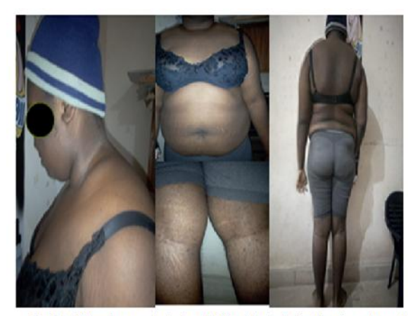
Fig. 1: L-R showing supraclavicular pad of fat, abdominal striae; hirsutism and truncal obesity

Patient was commenced on oral Lisinopril 5mg daily, Tabs -methyl dopa 250mg 8hrl, Tabs Ketoconazole 200mg 12hrly and Caps Omeprazole 20mg 12hrly She was counseled for possibility of renal transplant. She was discharged after stabilization to continue follow - up and was followed up at the Endo crinology and Nephrology clinics, however, she was lost to follow-up.