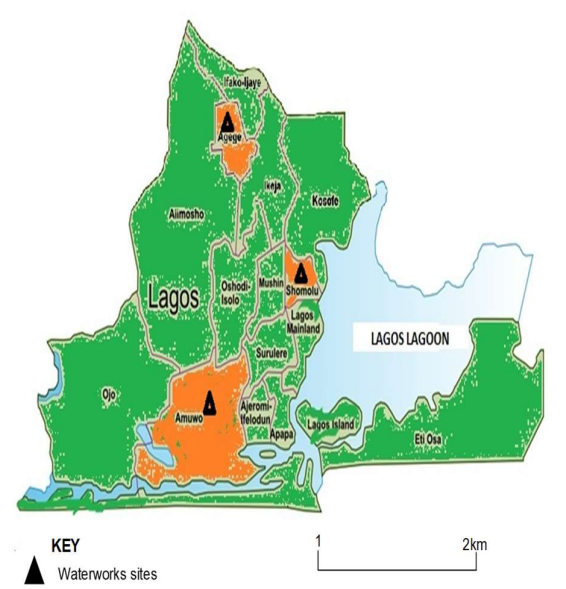
Fig. 1. Map of Lagos showing some areas where water works are sited.

It is therefore necessary to measure the radioactivity and determine the radiological and associated health impact of the pipe born water consumed by the inhabitants of the Lagos megacity in Nigeria