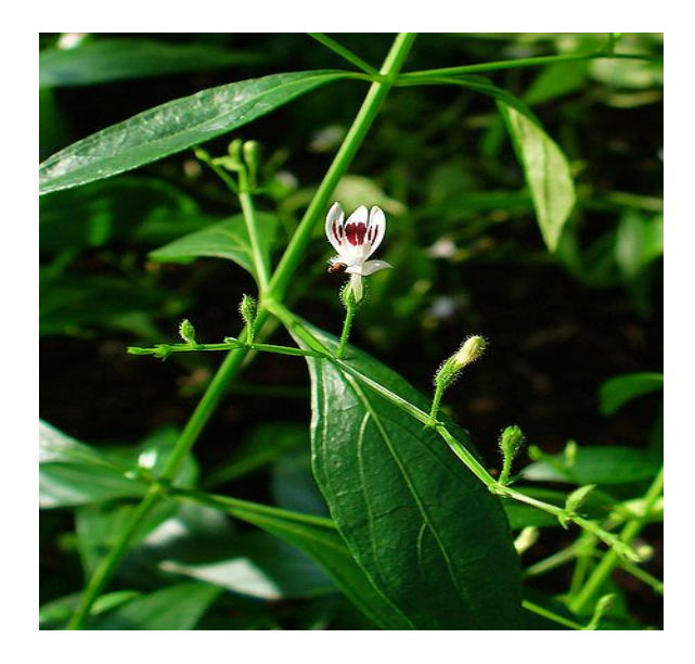
Figure 1: Andrographis paniculata

The aim of this study was to formulate A. paniculata cream and evaluate the effect of unrefined and refined shea butter on the antimicrobial activity of A. paniculata cream and comparing the antimicrobial activity of methanolic extract of A. paniculata leaves with aqueous extract. Physical stability of the the formulations under different storage time and temperature was also investigated.