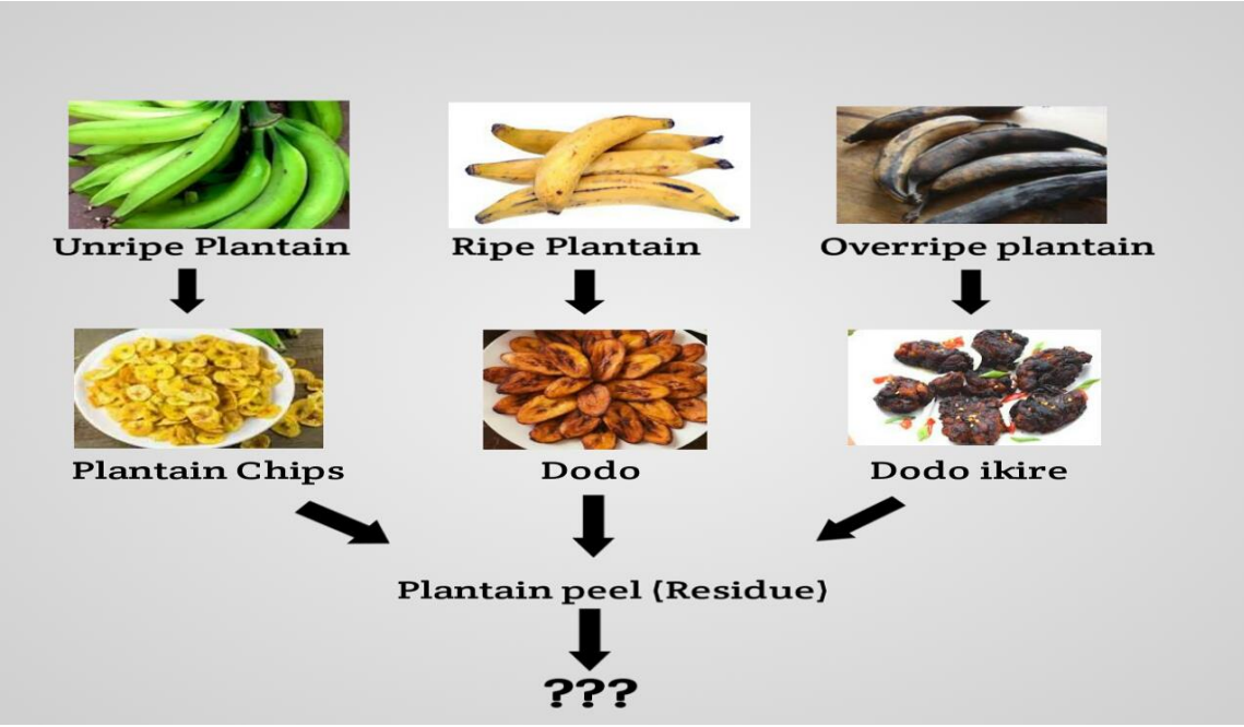
Figure 1: Plantain peels as a residue from pulp processing in Nigeria across all stages of ripening

Fruit ripening is a genetically programmed, highly coordinated process of organ transformation from unripe to ripe stage, to yield an attractive edible fruit with an optimum blend of color, taste, aroma and texture (Maduwanthi and Marapana, 2017). It is a combination of physiological and biochemical processes. Apart from changes in peel color, the rapid loss of firm texture is another noticeable change observed during ripening. It is generally accepted that the modification of the physical and chemical features of parenchyma cell walls and the loss of