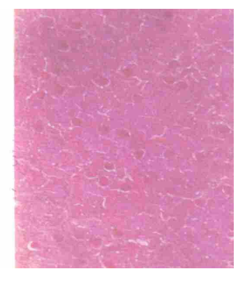
FIG. IIa: Cross – section of the kidney of pregnant Sprague – Dawley rats treated with Paracetamol for 24 days ( 10^{th} day of gestation – 13^{th} day after parturition) and sacrificed on the 24^{th} day. Stains: haematoxylin &eosin. Magnification: X100