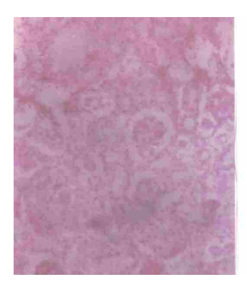
FIG 1: Cross – section of the kidney of pregnant control animals (group A). Stains: haematoxylin & eosin. Magnification: X100.