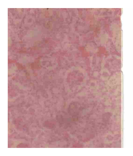
FIG. II b: Cross- section of the kidney of pregnant Sprague – Dawley rats treated with Paracetamol for 24 days (10<sup>th</sup> day of gestation -13<sup>th</sup> day after parturition) and sacrificed on the 24<sup>th</sup> day. Stains: haematoxylin & eosin. Magnification: X100.