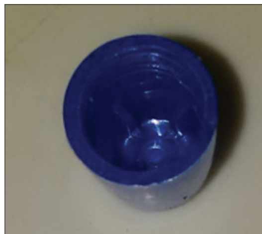
Figure 3: Object as seen in its unaltered state

contributed to it being missed. Although our patient had a single FB in the airway, there is a higher likelihood of FB being missed if they are multiple as reported