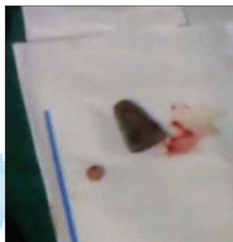
Figure 2: Object removed at bronchoscopy