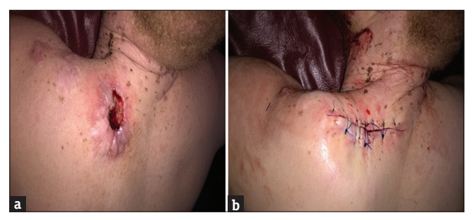
Figure 2: (a) Squamous cell carcinoma on the upper back (b) after excision and closure of the lesion