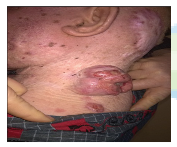
Figure 4: Malignant melanoma on the neck