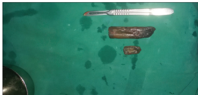
Figure 2: Retrieved foreign body