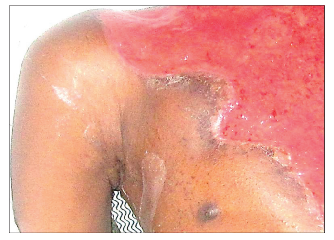
Figure 1: Wound edges become light pink in color and start to slope inwards toward the wound

Patients were also screened for background compromising systemic conditions which were attended to when present in conjunction with appropriate specialties within our hospital. Other supportive therapy including adequate nutritional build up was also carried out for the patients.