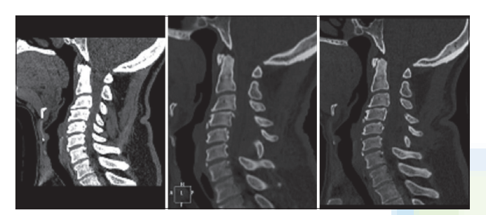
Figure 3: Serial computed tomography scans of a patient preoperative (right), immediate postoperative (center) and at 1 year follow-up (left)

female ratio was 3:1 [Table 2]. The technique of FL was used in all cases. All patients presented with advanced disease, with 25%, 36%, and 30% at Nurick Grade 3, 4, and 5, respectively [Table 3]. There were no significant perioperative complications. One year postsurgery, all patients with Nurick Grade 2 and 3 improved to Grade 1 or 0, while 9 (69%) of the 13 at Grade 4 improved to Grade 2 or better. Only 1 (9.1%) of 11 operated at Grade 5 did not improve while 3 (27%) improved to Grade 2 or better [Table 3]. This improvement was sustained at 5 years in the 19 patients that were followed for the duration [Table 4]. No postoperative instability was identified on follow-up.