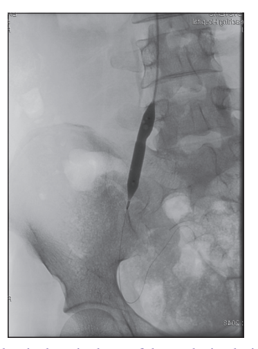
Figure 2: Transluminal angioplasty of the occlusive lesion at the origin of the right common iliac artery