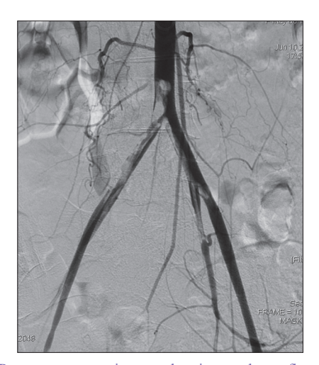
Figure 3: Posttreatment angiogram showing moderate flow restoration in the right iliofemoral arteries