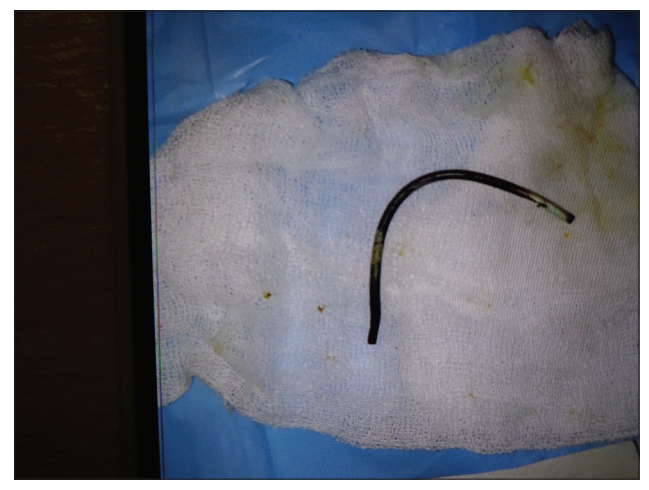
Figure 3: Stent retrieved via colonoscope

definitive surgery. However, there are certain limitations in its use when the biliary obstruction cannot be bypassed due to tight nature of the stricture. In such cases, bile duct stenting is done