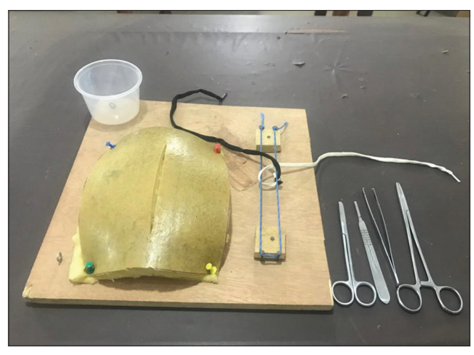
Figure 3: Locally assembled basic suturing kit

We attained this success with a low budget as we are unable to secure funding or sponsorship at this preliminary phase. The models and mannequins used