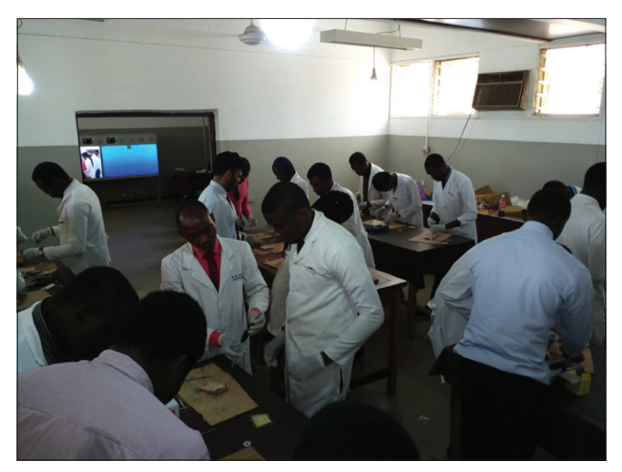
Figure 1: Undergraduate suturing skills training session in Ile-Ife, Nigeria

In self-assessment report after the workshop, all but 3 (1.7%) students felt very confident in handling basic instruments, 102 (56.7%) were confident of their proficiency in basic suturing, 68 (37.8) were less confident, whereas 10 (5.6%) were not confident. On a Likert scale rating, 53.1% of the participants agreed that the time allotted was adequate for their skills acquisition, 15.6% disagreed, whereas 31.3% were neutral. Overall, 160 (88.9%) adjudged the environment of the skills laboratory conducive to skills acquisition.