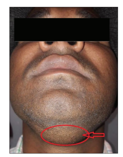
Figure 1: Single large swelling over the submental region (preoperative)

Clinically, there will be long duration of slow-growing, single, localized, mobile, soft, firm or doughy, usually