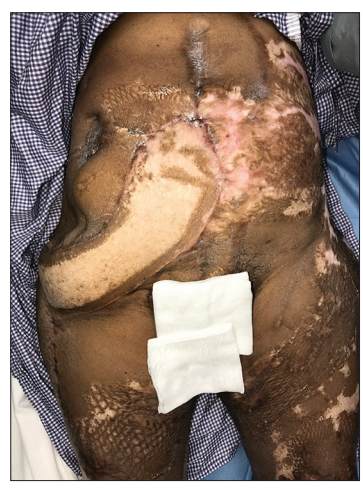
Figure 3: Postoperative after 6 months

are rectus muscle flap, lattismus dorsi muscle flap, and external oblique flap. Distant flap options are TFL muscle flap and rectus femoris flap. Free TFL graft is also an option for abdominal wall reconstruction.<sup>[3]</sup> The