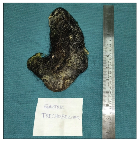
Figure 7: Specimen picture of giant gastric trichobezoar weighing 520 g

advantage of removing large and hard trichobezoars, which are nonfragmentable. More than 100 cases of trichobezoar removal by laparotomy have been reported. Gorter et al. advocate laparotomy as the treatment of choice for the removal of trichobezoar due to the following advantages such as low complexity, less