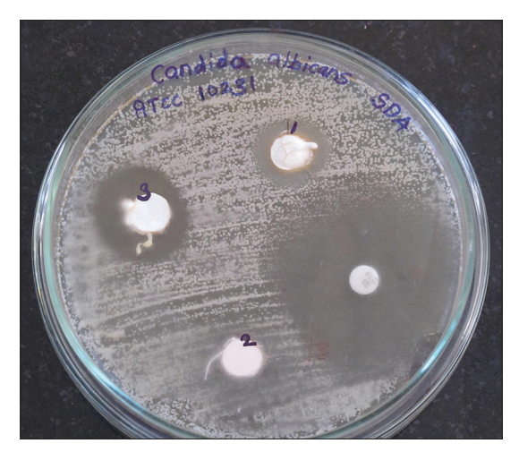
Figure 2: Zone of inhibition exhibited by AH-Plus sealer was higher than the other two sealers, whereas the standard antibiotic disc of fluconazole showed the highest zone of inhibition among all the groups against Candida albicans

BC sealer is a newly introduced endodontic sealer (Endosequence BC Sealer, Brasseler USA, Savannah, GA, USA). It has an alkaline pH, high calcium ions release, and suitable radiopacity and flow capacity. It also exhibits antibacterial activity and biocompatibility.<sup>[16]</sup> BC sealers are highly hydrophilic which allows them to spread easily over the root canal walls and fill the lateral microcanals too. During the setting, these sealers expand and form a chemical bond with the canal walls.<sup>[17]</sup>