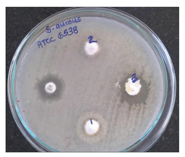
Figure 1: Zone of inhibition exhibited by the standard antibiotic disc of amoxiclav was higher than bioceramic sealer and Epiphany self-etch sealer, whereas AH-Plus sealer showed the highest zone of inhibition among all the groups against Staphylococcus aureus

Rathod, et al.: Antimicrobial efficacy of root canal sealers