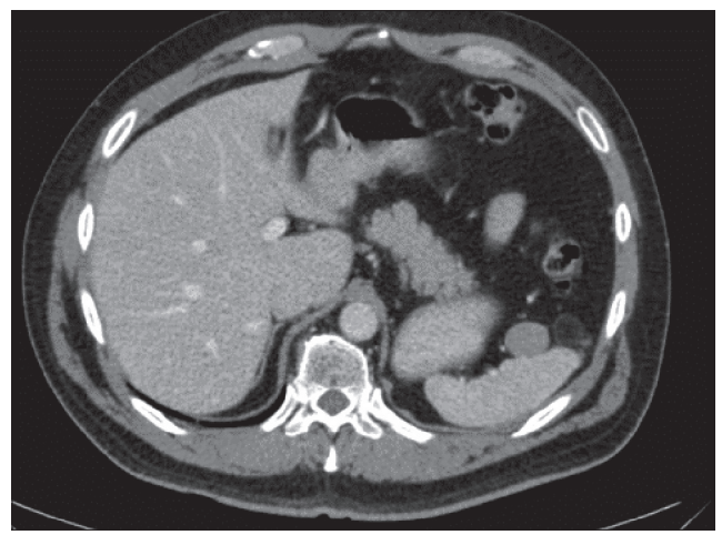
Figure 1: Enhanced computed tomography showing the tumor adjacent to splenic hilum

Sánchez-Gollarte, et al.: Splenic hilium desmoid type fibromatosis