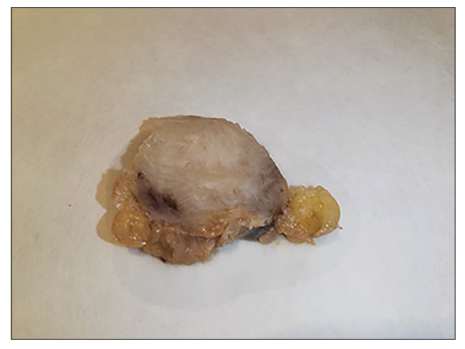
Figure 2: Macroscopic view of the tumor

Different risk factors have been implicated in DTF etiology, including genetic mutations, female gender, or previous surgery next to the place where DTF occurs.<sup>[5]</sup> Estrogens are maybe implicated in the pathogenesis because DTF is more frequent in women, and spontaneous regression has been described after