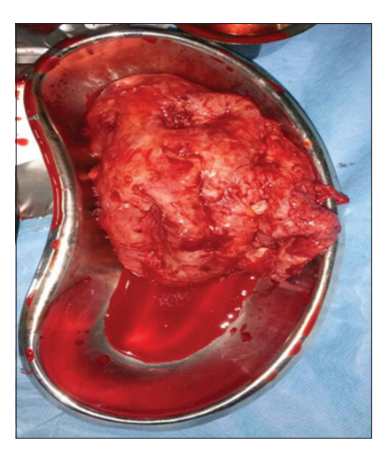
Figure 2: Excised mass

features of suppuration may be absent, as is in this case. However, cold abscesses from pyogenic organisms have been reported in otherwise immunocompetent hosts.<sup>[8]</sup>