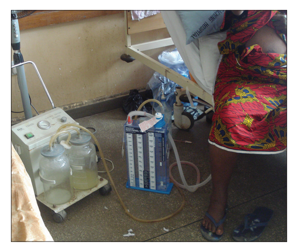
Figure 4: More recent modification of the double or triple bottle systems (e.g., Atrium<sup>®</sup>, Pleurvac<sup>®</sup>), been used on a patient and connected to a suction device