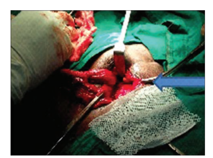
Figure 1: Preparation for mesh insertion

The lateral end of the mesh was then slit to create a passage for the cord. The two limbs of the slit, was then doubled-crossed