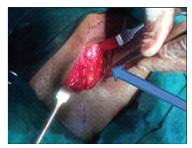
Figure 4: Reconstitution

This assertion has been confirmed by other workers from the African and West African sub-region.<sup>[8,10,11]</sup> In addition, experimental studies on mice have demonstrated that implanted pieces of mosquito-net cloths in tissues made of polyester can