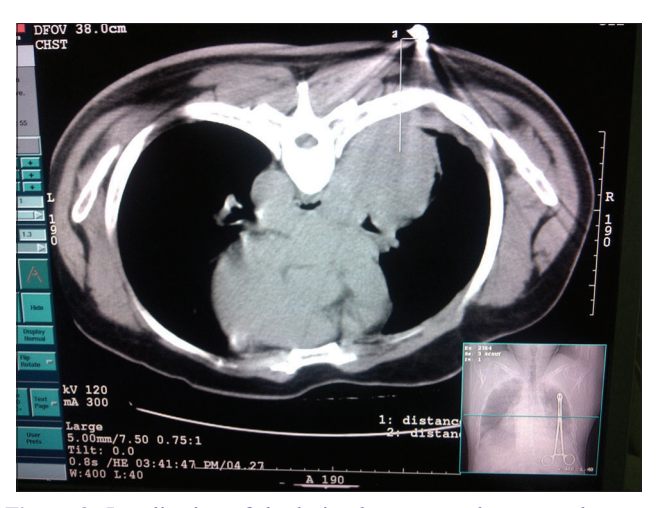
Figure 3: Localization of the lesion by computed tomography scan ruler indicated by the white vertical line in the lesion on the right and a horizontal limb pointing to the metallic object