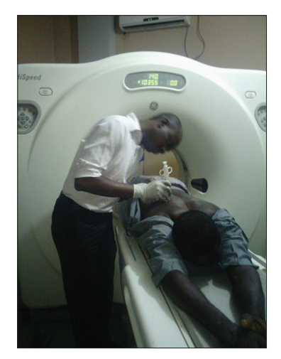
Figure 1: Surgeon inserting trucut biopsy needle with patient prone in computed tomography gantry

Twenty-six patients with clinical and radiological evidence of intrathoracic mass were counseled and consent obtained for the procedure over a period of 5 years (2011–2015). They were positioned in the gantry either supine or prone [Figure 1]. A scout scan