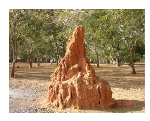
Fig2 Ant Hill For therapy

The father had previously had enuresis in 58% of all fathers and 28% of mothers had been affected. Both parents were affected in 14% of parents