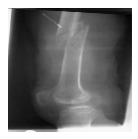
Fig iii Rt. femoral pathological fracture

The mass in the left thigh had increased tremendously in size. On clinical examination, the mass was firm and tender, not